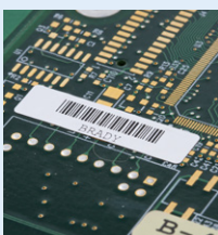
Circuit board labels