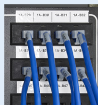
Voice & data communications