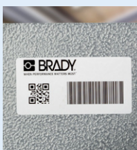
Asset tracking labels