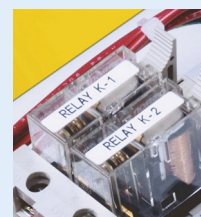
General purpose labels